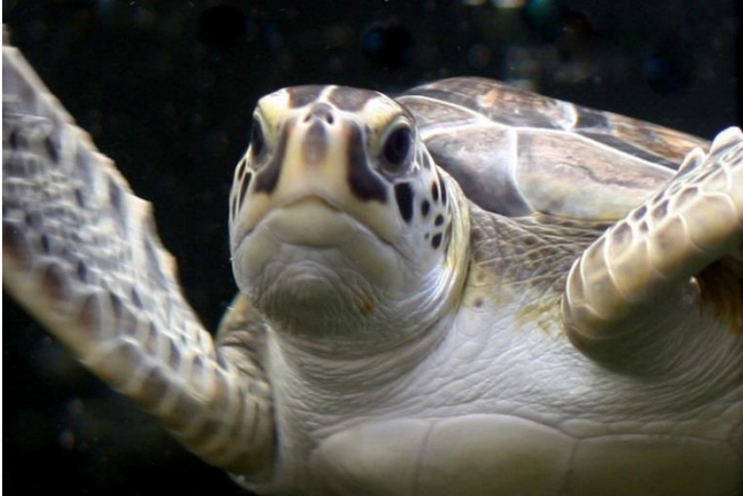
Loggerhead Turtle (Caretta caretta) SC State Reptile

Loggerheads received their name from having a relatively large head, which supports powerful jaws that enable them to feed on hard shelled prey such as whelks and conch. The top shell (carapace) is slightly heart shaped and reddish brown in adults while the bottom shell (plastron) is usually a pale yellowish color. The length of the adult is approximately 36 inches and they weigh around 250 pounds.