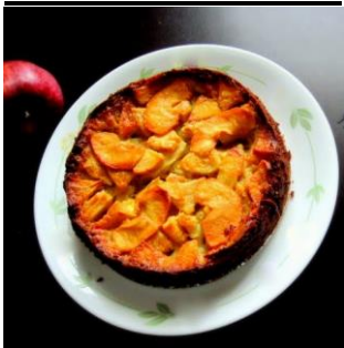
Apple Nut Cobbler

4 cups thinly sliced apples ½ cup sugar ½ tsp cinnamon ½ cup chopped nuts 1 cup all-purpose flour 1 cup sugar 1 tsp baking powder ¼ tsp salt 1 egg slightly beaten ½ cup evaporated milk 1/3 cup melted butter ¼ cup chopped nuts