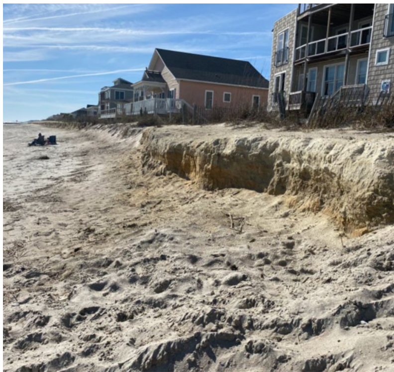
Edisto Beach Erosion

We continue our work with the US Army Corps of Engineers (USACE) on this important project, which will reduce the risk of damage to life and structures landward of the dunes. Sharing the cost of beach nourishment with the federal government, eligibility for 100% federally funded repairs after declared disasters, and an attractive and usable beach are added benefits of this project. The total cost of construction is $31 million, with the federal cost at $20 million and the Town cost of $10 million. The Town has received $7.5 million from the South Carolina Parks, Recreation, and Tourism Department for this project, and the Town will receive approximately $5 million in-kind credit for previous work completed. We are on target to begin construction in Winter 2025/Early Spring 2026, with project completion by May 2026. The easement and construction line map has been established by the USACE, and easements will be discussed with beachfront owners in the near future.