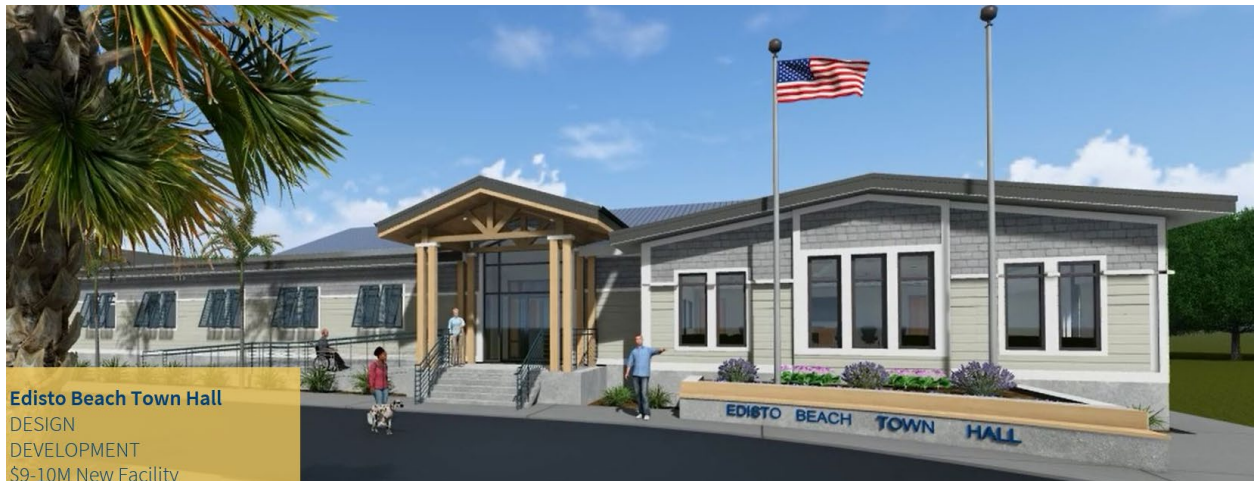
Rendering of the front of the proposed Edisto Beach EOC/Town Hall

This $10 million project, which is being paid from the Colleton County Capital Project Sales Tax, is scheduled to begin construction in early 2025, with a 12 to 14-month construction period. Over the past year, we have been working with the architect on the facility’s design and working to obtain the required permits. One of the facility highlights includes an Emergency Operations Center (EOC) which will house emergency personnel and Town staff before, during, and after emergency events. This plan will allow for a quicker, more efficient response and recovery for the Town. The new Town Hall is designed with extra space for Council Chambers, and more privacy areas for residents to discuss their needs with Town Hall staff. Once the new facility is built, the Police Department will move into the current Town Hall building, and the Fire Department will extend their space into the current Police Department area.