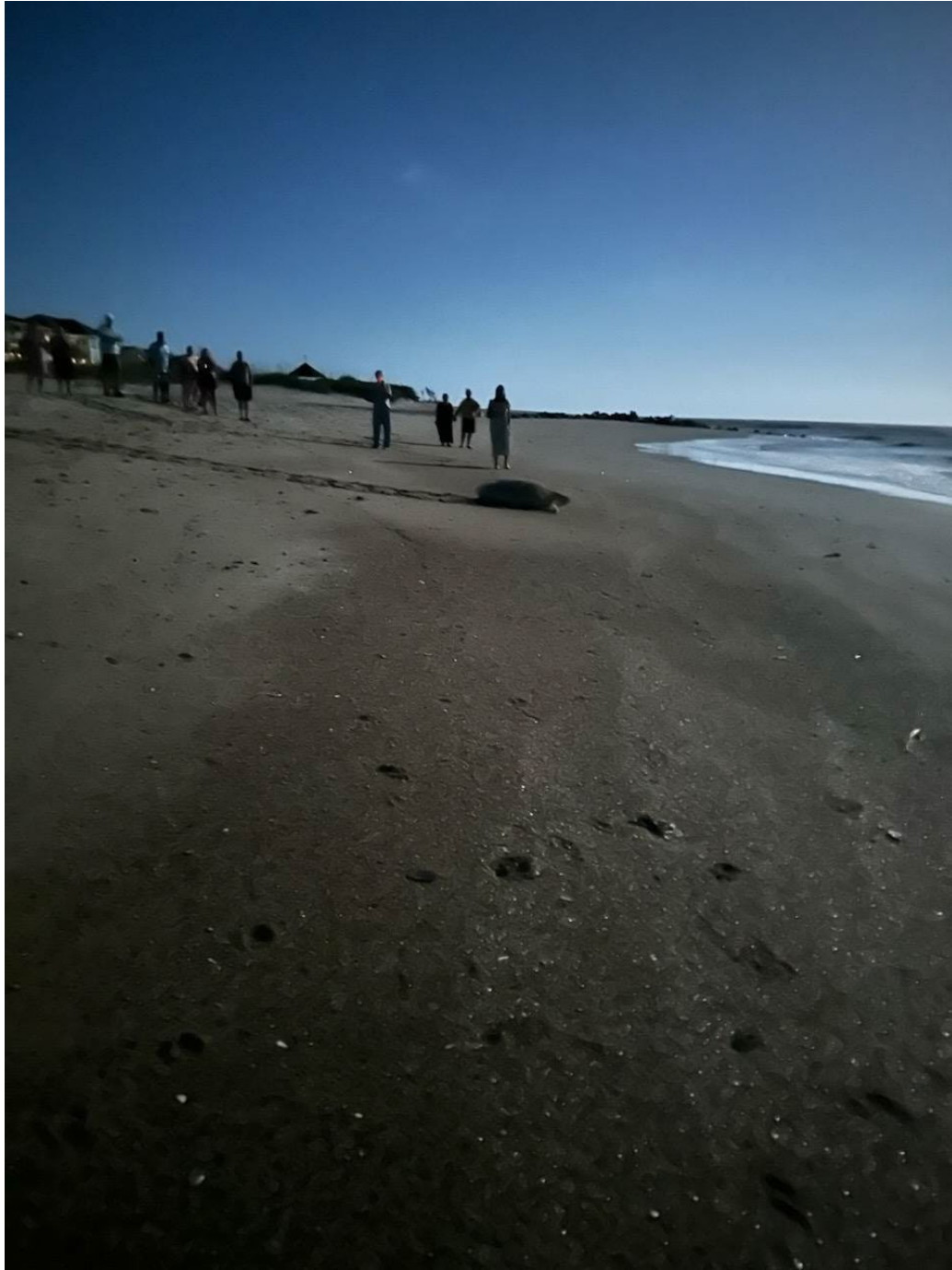
Turtle returning to the ocean after laying her eggs