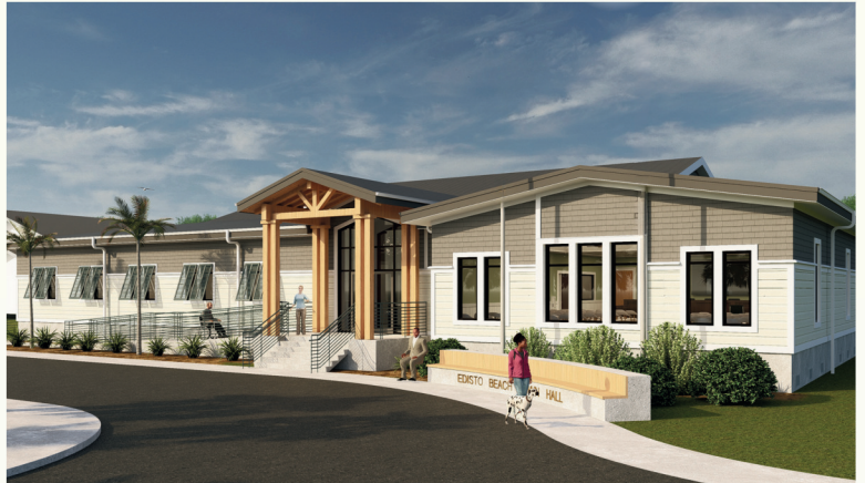
Rendering of the front of the proposed Edisto Beach EOC/Town Hall

This $10 million project, which is being paid from the Colleton County Capital Project Sales Tax, is scheduled to begin construction in early 2025, with a 12 to 14-month construction period. Over the past year, we have been working with the architect on the facility's design and working to obtain the required permits. One of the facility's major functions includes an Emergency Operations Center (EOC) which will house emergency personnel and Town staff before, during, and after emergency events. This plan will allow for a quicker, more efficient response and recovery for the Town. The new Town Hall is designed with extra space for Council Chambers, and more privacy areas for residents to discuss their needs with Town Hall staff. Once the new facility is built, the Police Department will move into the current Town Hall building, and the Fire Department will extend its space into the current Police Department area.