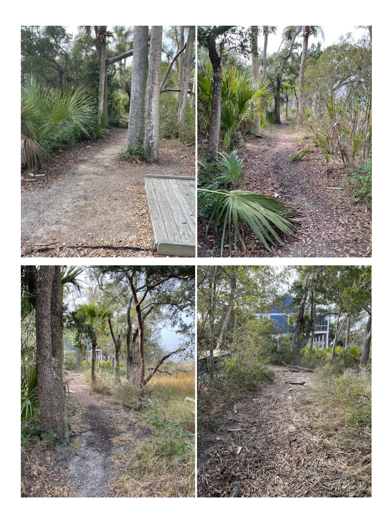
Page | 17